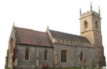
Hinton on the Green